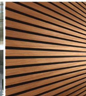
WOOD SLAT WALL