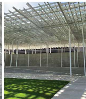
HORIZONTAL ALUMINUM FIN SYSTEM WHITE ANODIZED