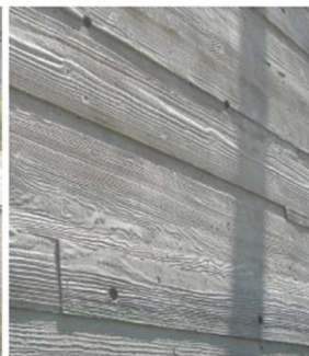
CAST-IN-PLACE BOARD FORM ARCHITECTURAL CONCRETE