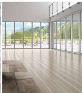
STOREFRONT GLAZING SYSTEM CLEAR