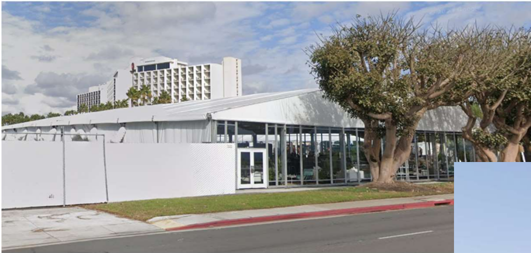
EXISTING CONDITIONS: 21,121 SF

PROPOSED BALLROOM PROJECT: 71,700 SF total