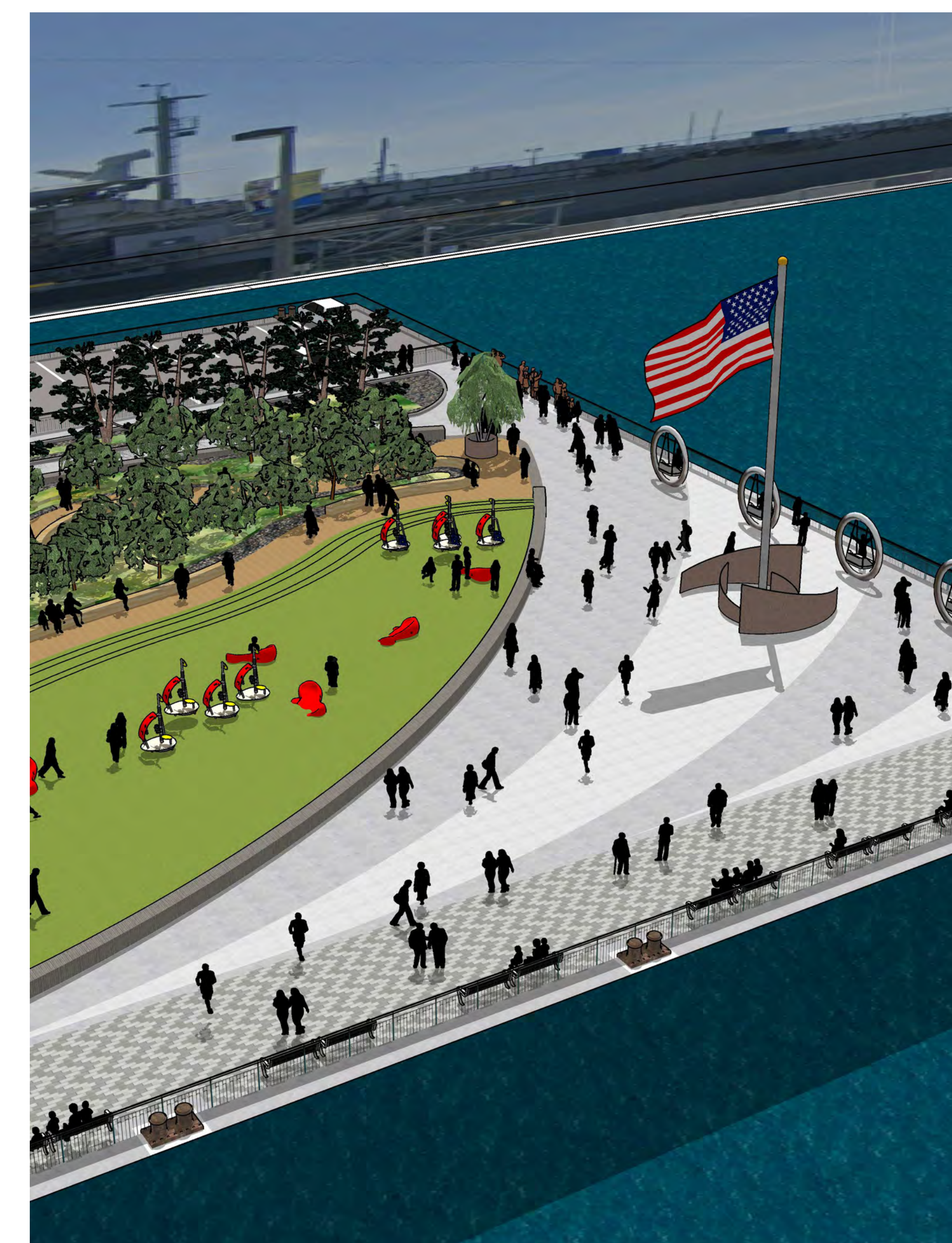
VIEW AT WEST END OF PIER