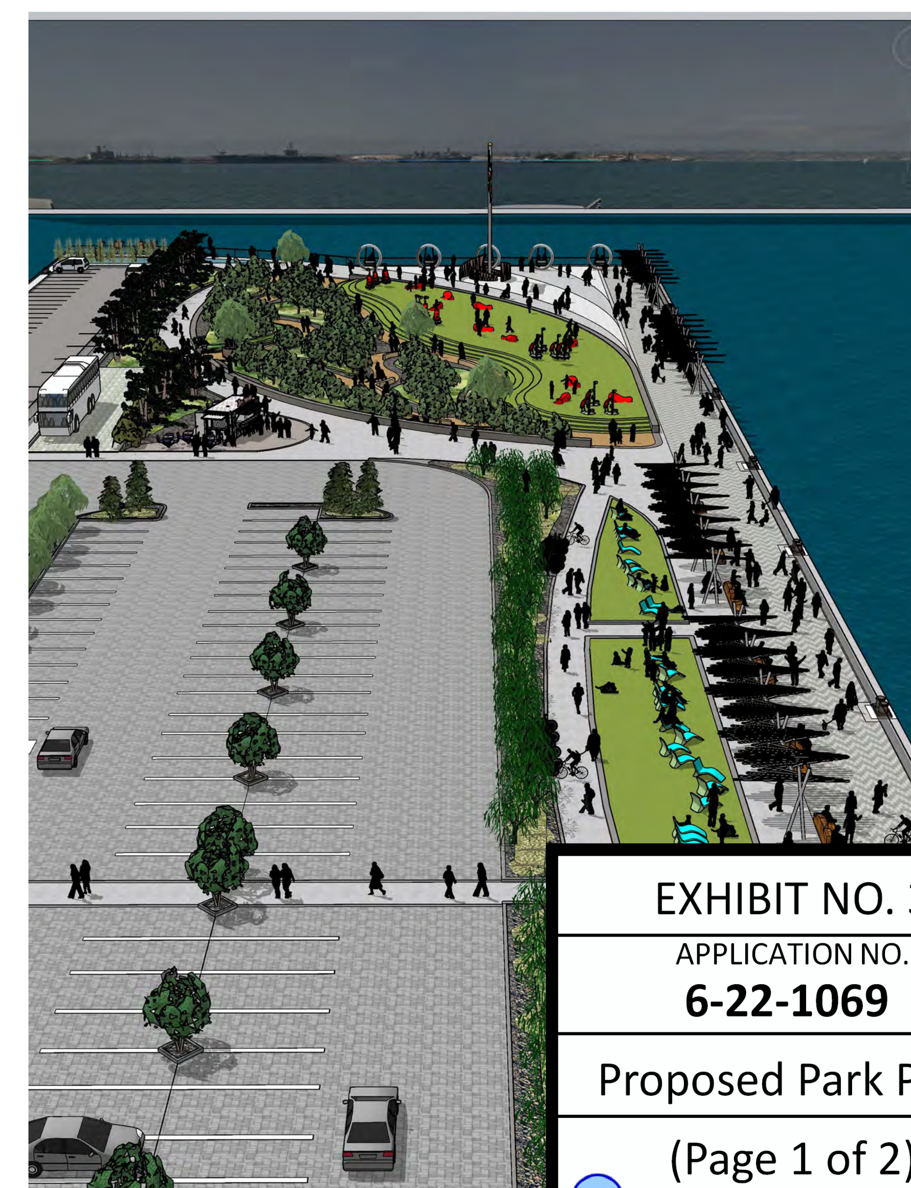
VIEW ALONG PROMENADE